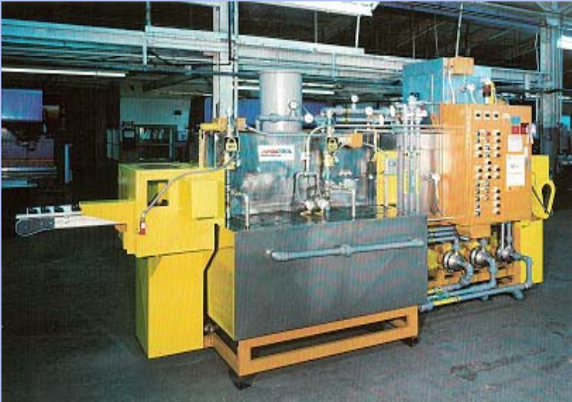
Automated Cellular Fuel Injection Pallet Washer